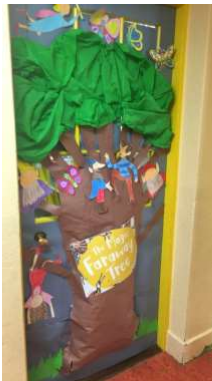
Second Class Door