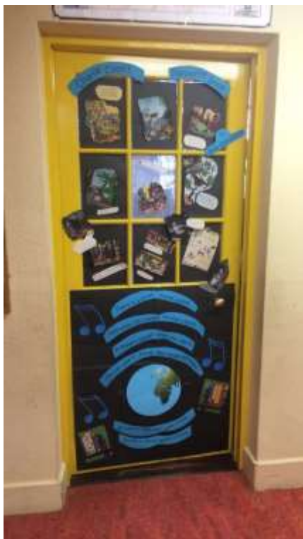
First Class Door