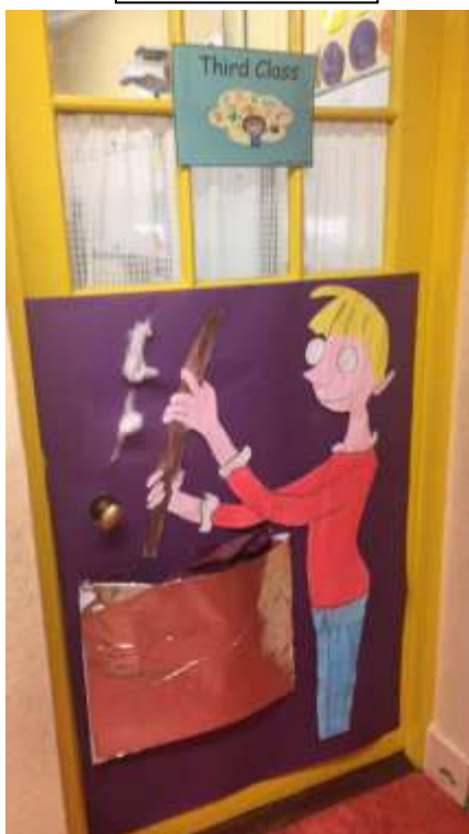
Third Class Door